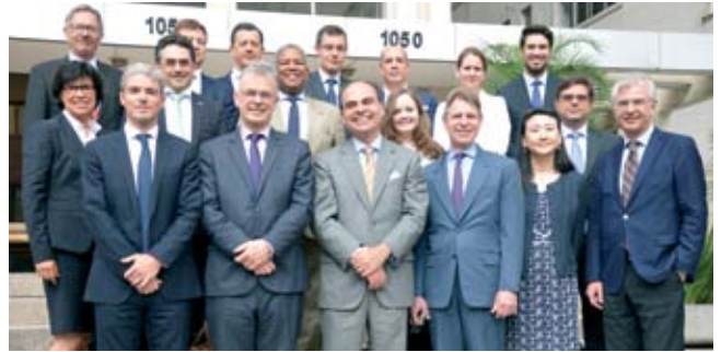
The Alliuris Brazil Conference