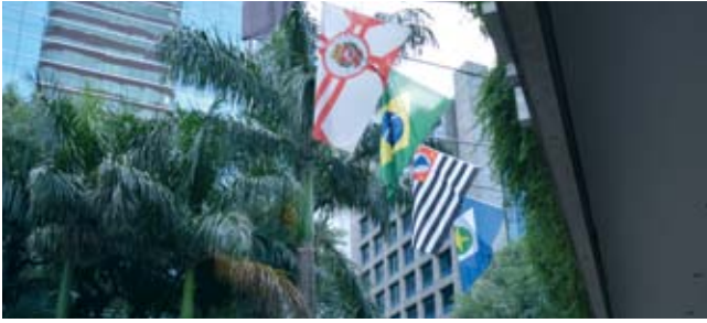
City of Sao Paulo