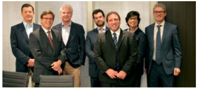
Conference in Rio de Janeiro

The firm is a corporate law firm, which prides itself on its high quality, dynamism, creativity and efficiency in servicing its clients, focusing on maintaining a close and accessible relationships. FBC services national and international clients from various sectors such as infrastructure (including oil and gas, energy, concessions, navigation), chemical and pharmaceutical industries, food and beverages, as well as services providers, among them telecommunications, technology, capital and financial markets. The dedicated team of lawyers specializes in business and tax law, customs issues, real estate transactions, contracts, labour law, administrative law, regulatory affairs as well as in litigation covering all these areas. The firm is located in Sao Paulo with another office in Rio de Janeiro and a representation in Brasilia. It has correspondents in other main Brazilian cities, which allows it to offer the highest level of legal services in all areas of business law since 1993.