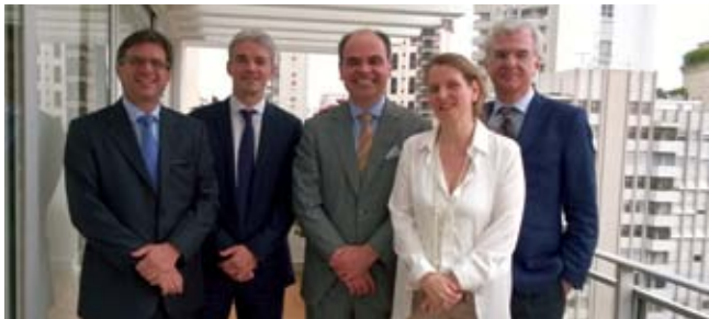
Conference in Sao Paulo

Pacheco Neto, Sanden, Teisseire Lawyers is a full service business office, with extensive multicultural experience, with clients in over 20 countries, including Germany, France, Scandinavia, the United States and China. The firm is an active member of various chambers of commerce and local and international corporate alliances. It is headquartered in Sao Paulo, a strategic partner in the state of Sao Paulo, and has other offices in Rio de Janeiro, Brasilia and Salvador. It has a platform of legal solutions in various areas of corporate law including mergers and acquisitions, corporate reorganizations, advisory and tax and labour litigation, commercial contracts, foreign investment, real estate transactions, intellectual property, compliance, mediation and arbitration and family planning and succession.